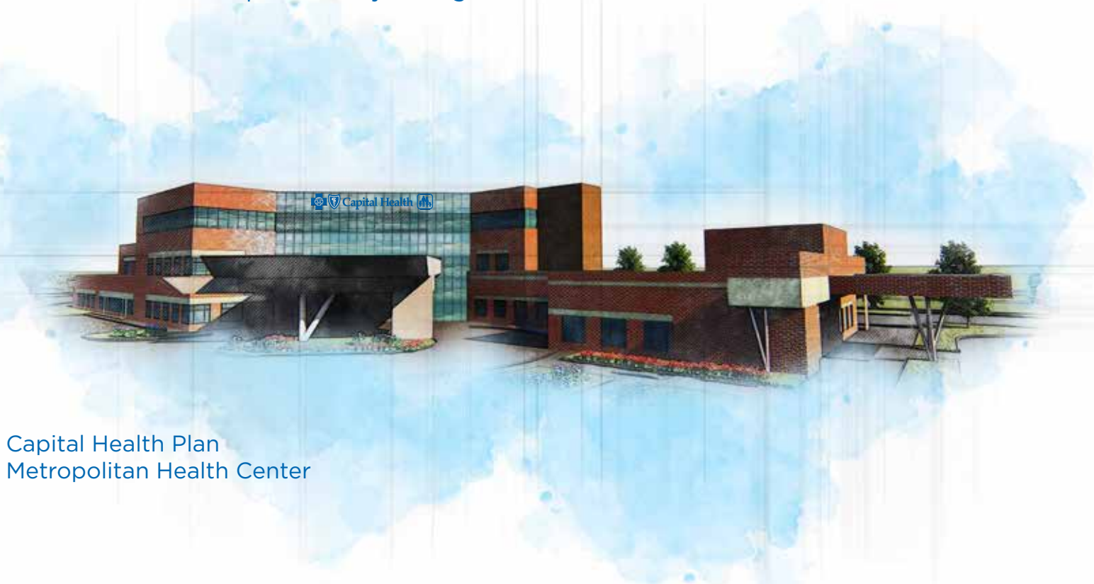
Capital Health Plan Metropolitan Health Center

This 24-hour resource is staffed by health care professionals who can assist members with their health-related questions by calling 850.383.3400.