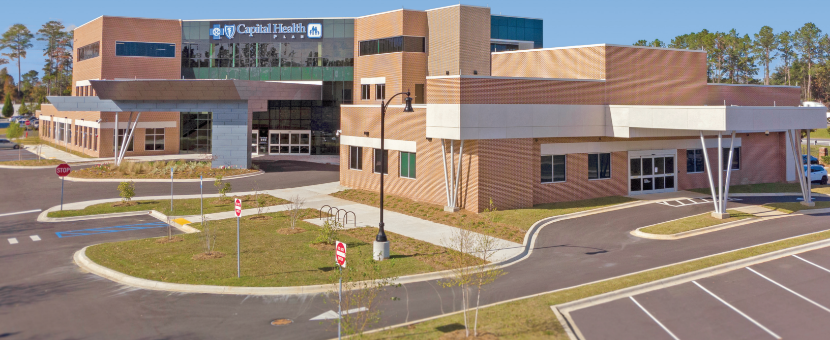
Capital Health Plan Metropolitan Health Center

The Governor's Square Health Center offers primary care physician services, X-ray and lab services, digital mammography, select imaging services, and an eye care center.